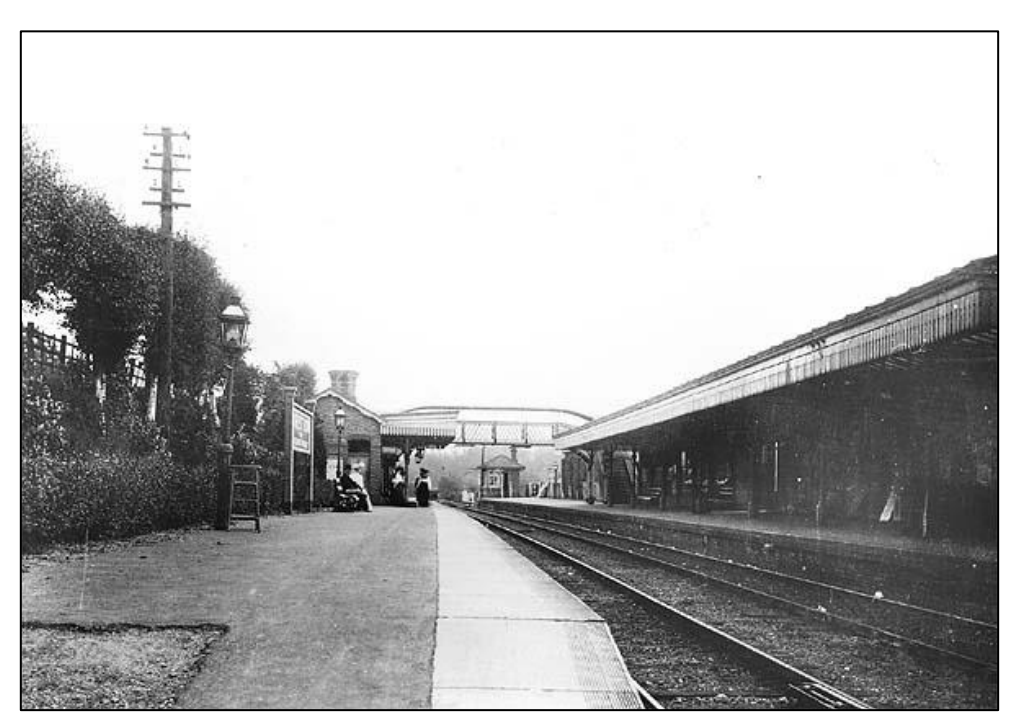
Forest Row station, early 20<sup>th</sup> century

26. An interesting feature pioneered by the LBSCR was the 'slip' coach. This would be detached at speed from a southbound express on the Brighton main line and halted at Three Bridges, whence it was hauled by locomotive to Forest Row. This service ran from 1888 until the main line was electrified in 1932. The fact that the slip coach reached as far as Forest Row is another hint of its relative importance for commuters compared with stations further east along the line.